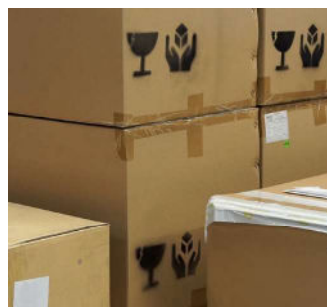
Stencil for safety