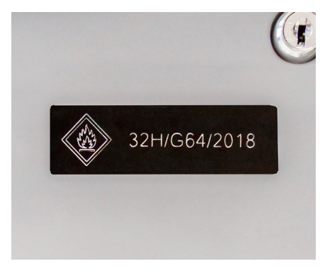
Marking tools for identification and equipment traceability