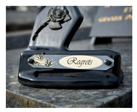
Funeral plaques and headstones engraving