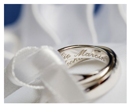
Personalizing and engraving jewelry