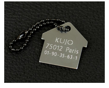
Pet and dog tags engraving